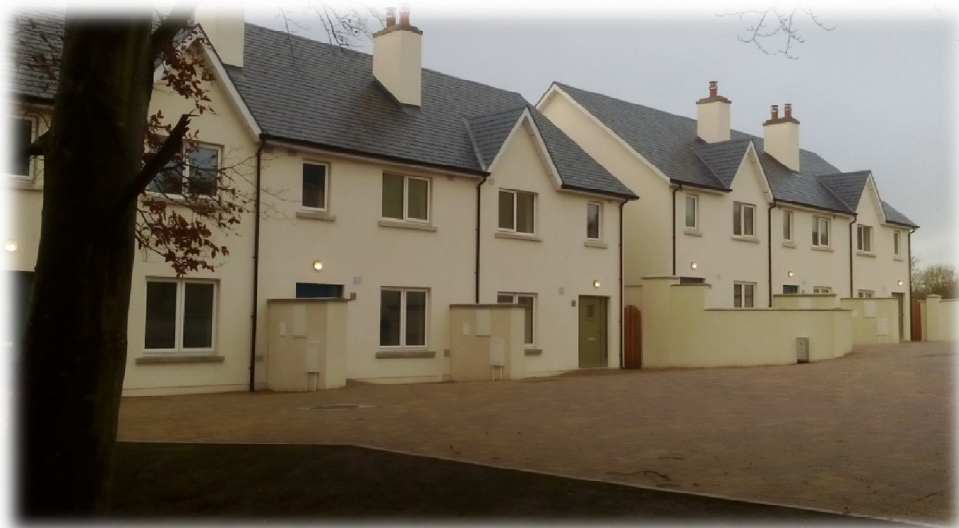
6 NEW HOUSES AT MANOR WALK ROSEHILL