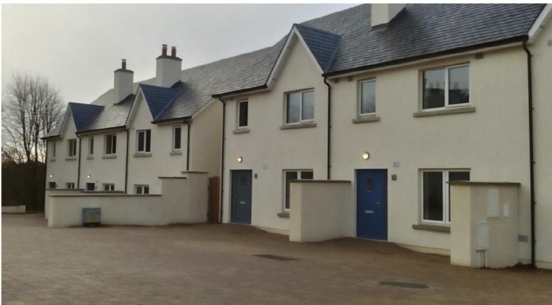
6 no A3 rated Houses at Manor Walk Rosehill, Kilkenny City, 4 no 3 bed and 2 no 2 bed.

Constructed by Kilkenny County Council. Completed and allocated in December 2016.