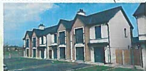
16 Houses under construction at Park Lane, Friary Walk, Callan