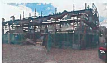
6 Houses under construction at New Road & Chapel Street, Mooncoin