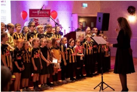
St. Brendan's NS Muckalee and Presentation Primary School Castlecomer

The launch included wonderful performances from children from St. Brendan's NS Muckalee and the Presentation Primary School Castelcomer