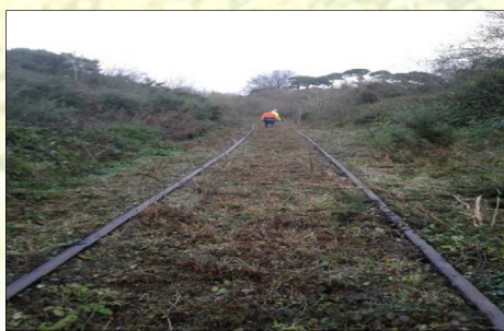
Walking the track following vegetation clearance in November

Works have commenced on the initial stages of the South East Greenway which runs from Ferrybank in Waterford to New Ross, terminating at Mount Elliot just after the tunnel is exited. The route covers a distance of 24km in total. To enable the detail designs to be completed for the project the track has been cleared of scrub vegetation allowing access for the first time in years. Site surveys are now being carried out along with bore hole investigations at sites where underpasses may be required for certain farming operations. In tandem with this process a team from Wexford and Kilkenny County Council are meeting with landowners along the entire route to discuss accommodation works.