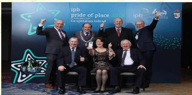
Ballyhale Development Association

Congratulations to the Kilmacow Pride of Place Group and Ballyhale Development Association on their success in the Competition.