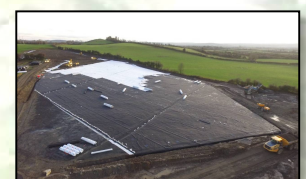
Aerial viewing looking South