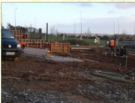
Preparing the shuttering for a climbing wall and terraced seating area in the proposed playground

The construction of the park will create a much needed central amenity facility for Ferrybank, incorporating a children's playground, walking route, teenager meeting point, and playing pitch.