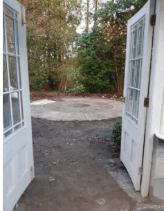
The floor of the conservatory partially relocated into an outdoor seating area