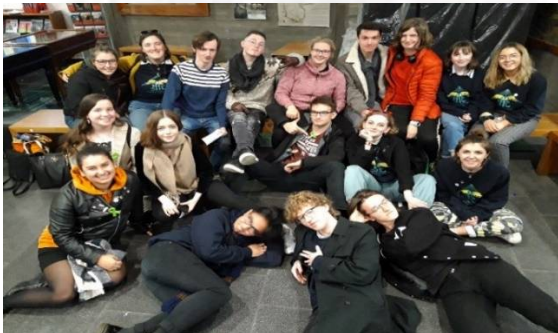
Kilkenny & Waterford Young Writers at the Lit Festival