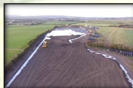
Aerial view looking North

Despite poor weather over the month of November, works on this 6-acre €1.4million project progressed well and remain on target for a completion date in Quarter 1 of next year. During the month of November, the gas collection system and the installation of the LLDPE liner was substantially completed along with significant progress installing the sub-surface drainage system and the placement of the subsoil layer. Over the next two months works will be focused on the topsoil layer placement, the reinstatement of a native boundary hedgerow, fencing and the removal of the haulage access tracks.